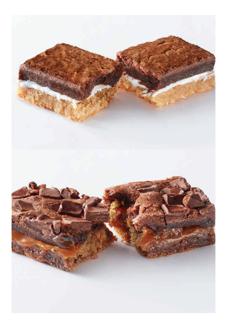
For more inspiration, visit www.generalmillscf.com